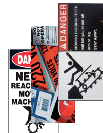
Machinery & Facilities management

The new advanced ink and print-head technology empowers the VP495 to deliver crisp text and high-definition graphics at a print resolution as high as 1200 x 1200 dpi – unmatched by any known pigment ink based solution of its class in the market today !.