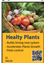
Horticulture, Fruits & Plants